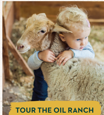
TOUR THE OIL RANCH