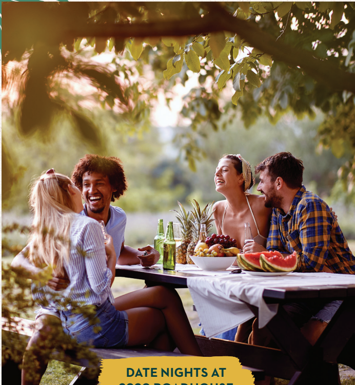
DATE NIGHTS AT 2920 ROADHOUSE

That's what life here is all about. From happy hours to social clubs, egg hunts to Santa brunches and everything in between. See below the types of fun events you can be a part of within the community and also locally in Tomball.