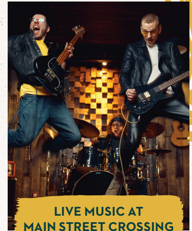
LIVE MUSIC AT MAIN STREET CROSSING