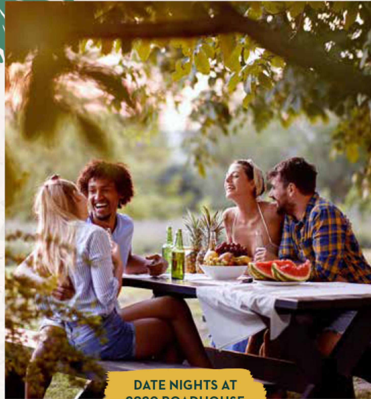
DATE NIGHTS AT 2920 ROADHOUSE

That's what life here is all about. From happy hours to social clubs, egg hunts to Santa brunches and everything in between. See below the types of fun events you can be a part of within the community and also locally in Tomball.