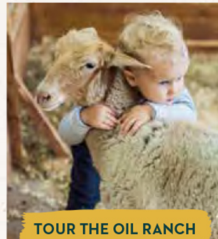
TOUR THE OIL RANCH