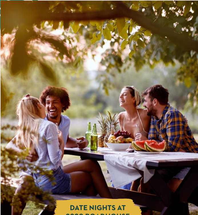
DATE NIGHTS AT 2920 ROADHOUSE

That's what life here is all about. From happy hours to social clubs, egg hunts to Santa brunches and everything in between. Check out below the types of fun events you can be a part of within the community and also locally in Tomball.