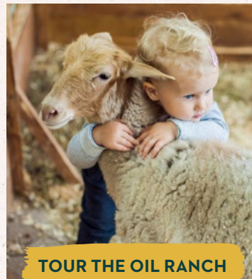
TOUR THE OIL RANCH